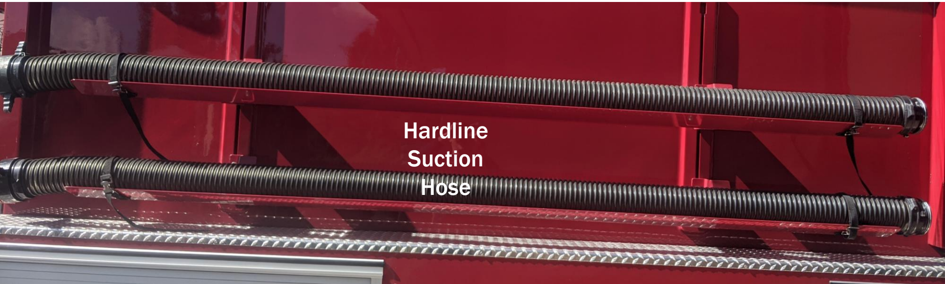
Hardline Suction Hose